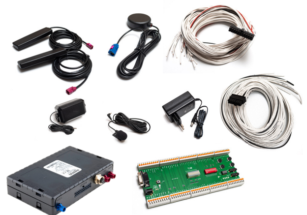
(owa450 gateway not included)